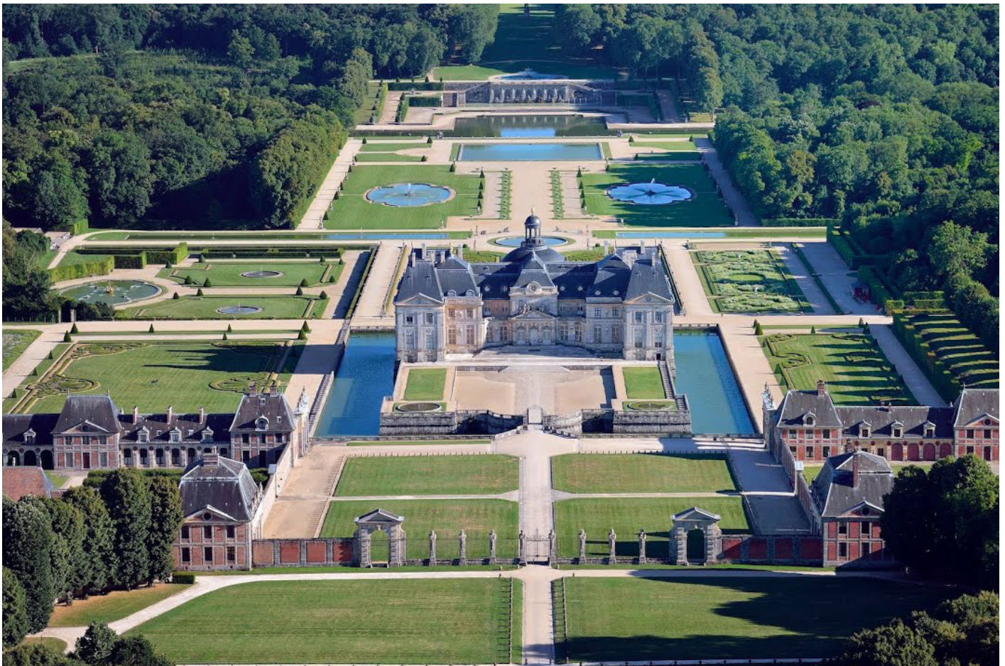
Château de Vaux-le-Vicomte

Additional history for this site is that it was once a military hospital during the Great Wars. An exhibition about this can be found in the adjacent buildings where soldiers were once cared for. In the cellar of this building is where you will find the onsite wine tasting room for the Château de Chenonceau winery. Guests can taste the estate wines and purchase bottles and souvenirs to take home with them.